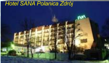
Hotel SANA Polanica Zdrój